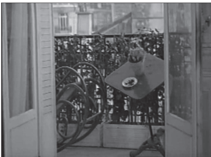
Plate 7: The suicide scene in Une femme douce (dir. Robert Bresson, 1969): first shot