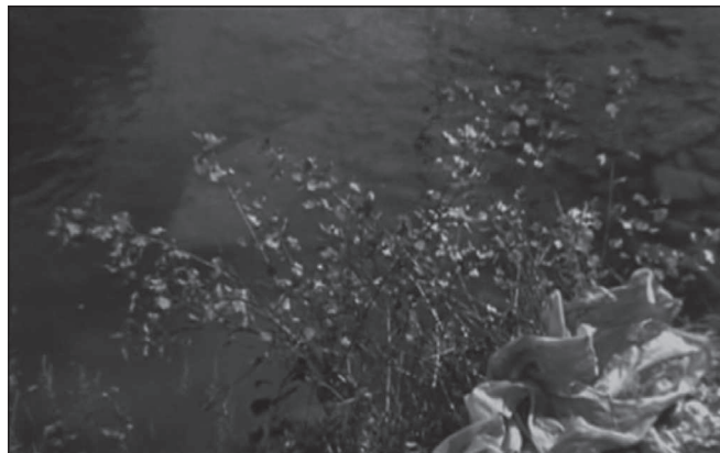
Plate 2: The last image of Mouchette (dir. Robert Bresson, 1967)

Of course she does not drown in her bath, but several other Bressonian characters are dangerously attracted to water. Mouchette, the eponymous heroine of Bresson’s previous film, best exemplifies this 8 . She too commits suicide, or maybe more to the point, she lets death take her. Playing roly-poly on a riverside bank, Mouchette rolls down the grassy slope three times. The last time, she falls in the water like a stone and does not attempt to get out: the river settles very quickly. A long white dress she had just been given and had wrapped around her body gets caught in vegetation: this impromptu shroud is all that remains of Mouchette after the river has swallowed her (see Plate 2). If one were to play Mouchette and Une femme douce one after the other, the two suicides would only be separated by the opening credits of Une femme douce .