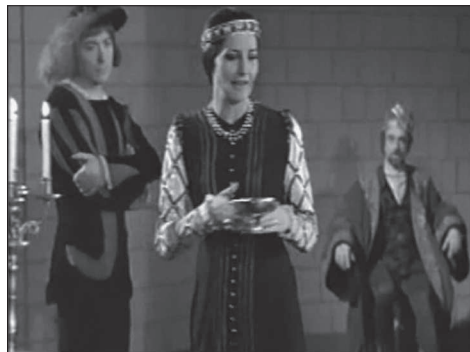
Plate 5: Horatio, Gertrude and Claudius in the performance of Hamlet in Une femme douce (dir. Robert Bresson, 1969)