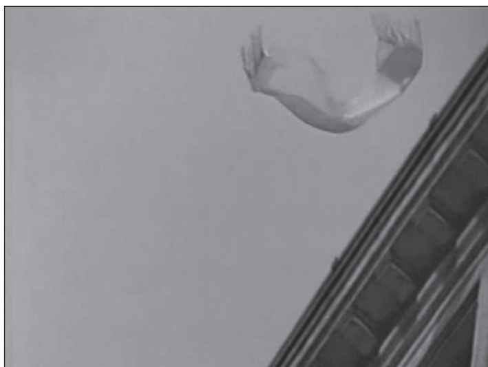
Plate 8: The suicide scene in Une femme douce (dir. Robert Bresson, 1969): second shot