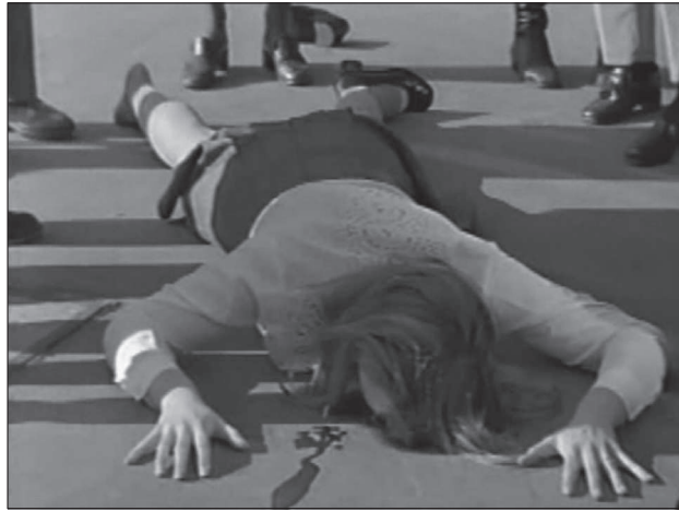
Plate 9: The suicide scene in Une femme douce (dir. Robert Bresson, 1969): third and last shot

The sequence of the young woman's suicide is composed of three shots: the table falling and the rocking chair vacillating on the balcony from which she has just jumped (see Plate 7), the white stole floating in the air and slowly falling (see Plate 8), and at ground level, cars stopping, legs rushing towards the body and the red blood stain, probably the only splash of bright colour in the whole film (see Plate 9). With its slow and gracious movements, the white stole floats in the air much as Ophelia's clothes float in the water. It also recalls Mouchette's long white dress when she fell into the river. Against the light blue sky, the white stole symbolises the body that we do not see, as well as the flight of the soul 26 .