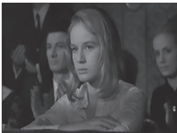
Plate 3: The pawnbroker and his wife at the end of the performance of Hamlet in Une femme douce (dir. Robert Bresson, 1969)