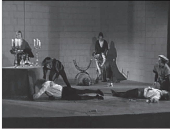
Plate 4: Hamlet plunging to his death in Horatio's arms (left) Claudius and Gertrude (middle) and Laertes (right) during the performance of Hamlet in Une femme douce (dir. Robert Bresson, 1969)

Comédie-Française 23 . This leads us to think that, in keeping with his views on acting, Bresson hired professionals to be able to demonstrate how bad they sounded on the big screen.