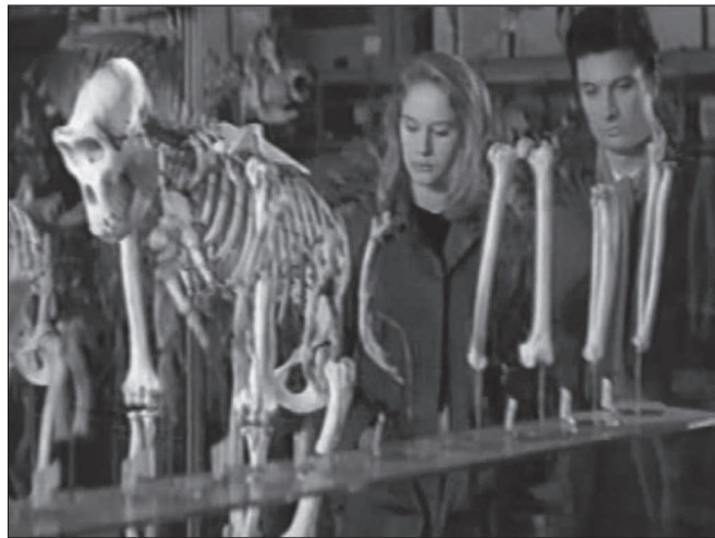
Plate 10: The couple at the Paris National Museum of Natural History in Une femme douce (dir. Robert Bresson, 1969)

The ultimate link between Hamlet and the gentle woman is their essential questioning: what is being human, living, dying? While Hamlet ponders the question "To be or not to be?" and confronts Yorick's skull in the graveyard, the gentle woman is absorbed in her natural history book, only to realize that all beings are made up of "the same raw material" ("la même matière première"). Hamlet and Une femme douce illustrate Bresson's thoughts, since a similar essential search, spelt out in the Notes on Cinematography with the same words as in Une femme douce , is at the core of his work as a filmmaker: "Not to shoot a film in order to illustrate a thesis, or to display men and women confined to their external aspect, but to discover the matter [matière] they are made of. To attain that 'heart of the heart' which does not let itself be caught either by poetry, or by philosophy or by drama" 32 .